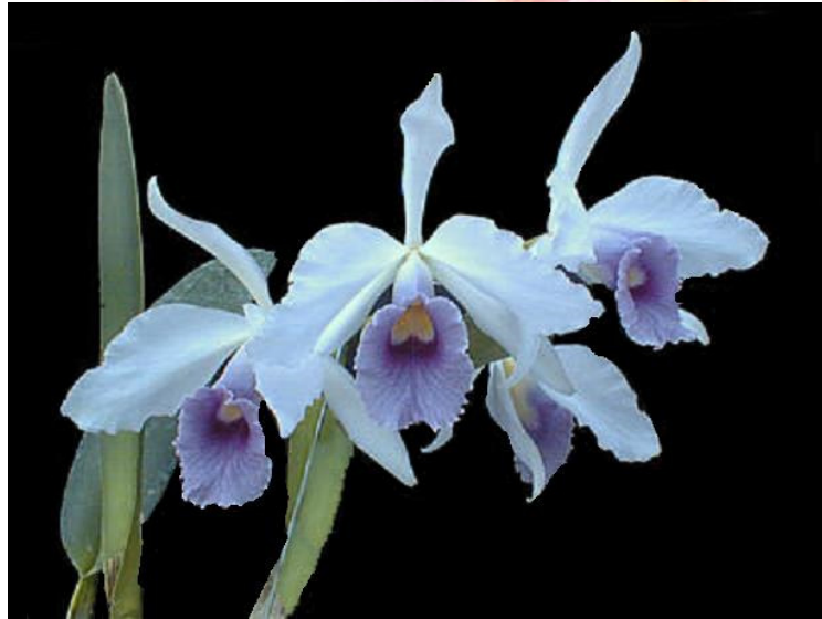
Photo is of L. Phelps Blue Passion "Phelps Farm"